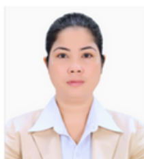
KHOUTH SOCHAMP AWATD